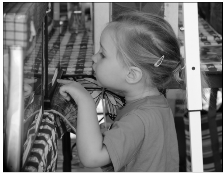
Oh my, look at that...