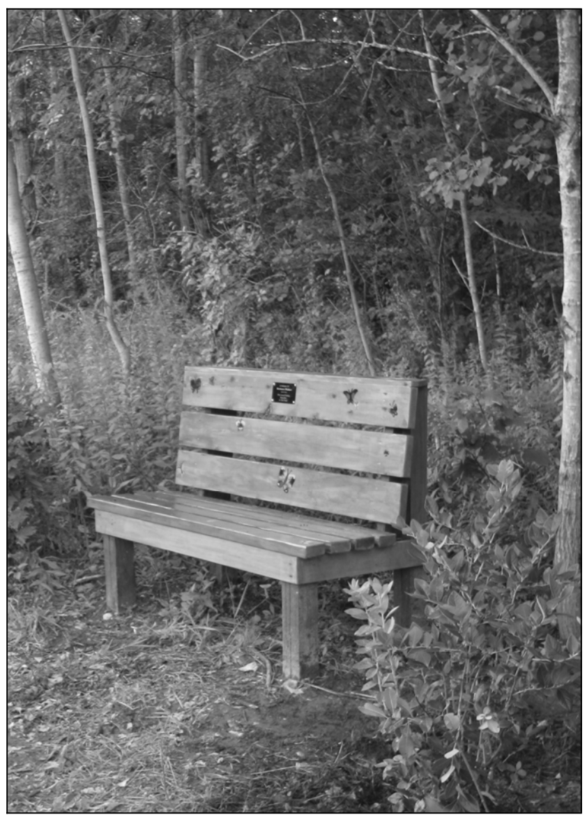
Barbara's Bench at Broad Meadow Brook