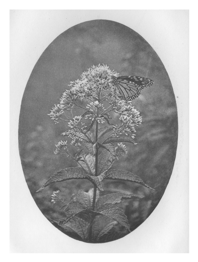
Monarch, Concord, Mass.