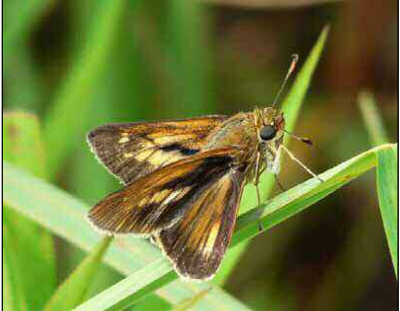
Dion Skipper, same individual; 7-18-09 Hinsdale, MA. Betsy Higgins